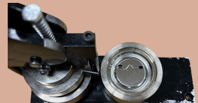
ROTATE AGAIN. PRESS DOWN FIRMLY TO FINISH THE BUTTON.

See the Lower Level Service Desk for assistance.