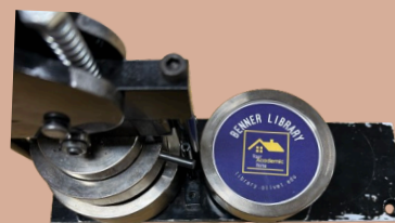
ROTATE CLOCKWISE PRESS DOWN FIRMLY.