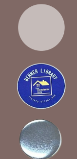
LAYER IN THIS ORDER