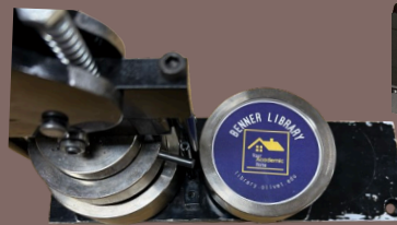
ROTATE CLOCKWISE PRESS DOWN FIRMLY.