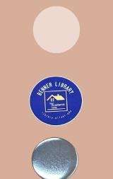
LAYER IN THIS ORDER